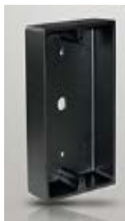
Surface mount back box p/n 9316

NOTE: The surface mount back box cannot be used with the illuminated push button.