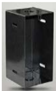
Flush mount back box p/n 9303