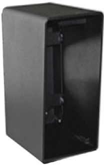
Gooseneck or in-wall mount back box p/n 9305

STANDARD BRASS FINISHES: Black Powder Coat, Brushed Chrome, Light Antique Brass, Oil Rubbed Bronze, Oil Rubbed Bronze Patina Edge, Pewter, Polished Brass, Polish Chrome, Satin Brass, Satin Nickel, White Powder Coat.